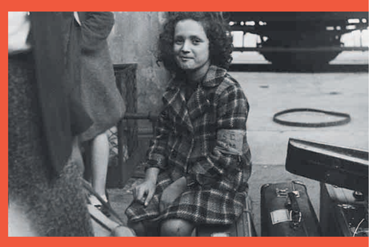
France, 1946. Young OSE girl on her way to the United States.