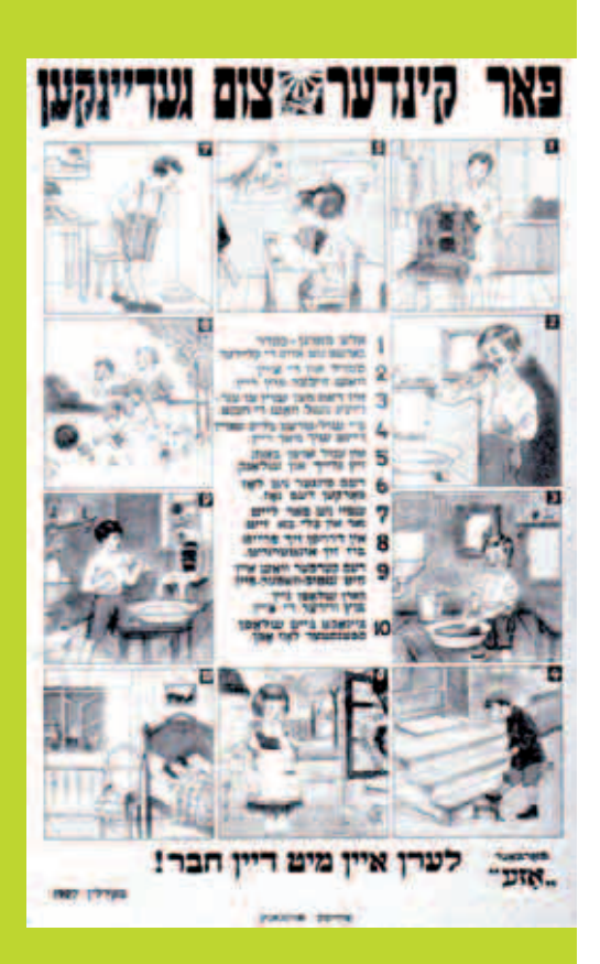
Berlin, 1927. DSE poster aiming at teaching the basic rules of hygiene to children. DSE Fund