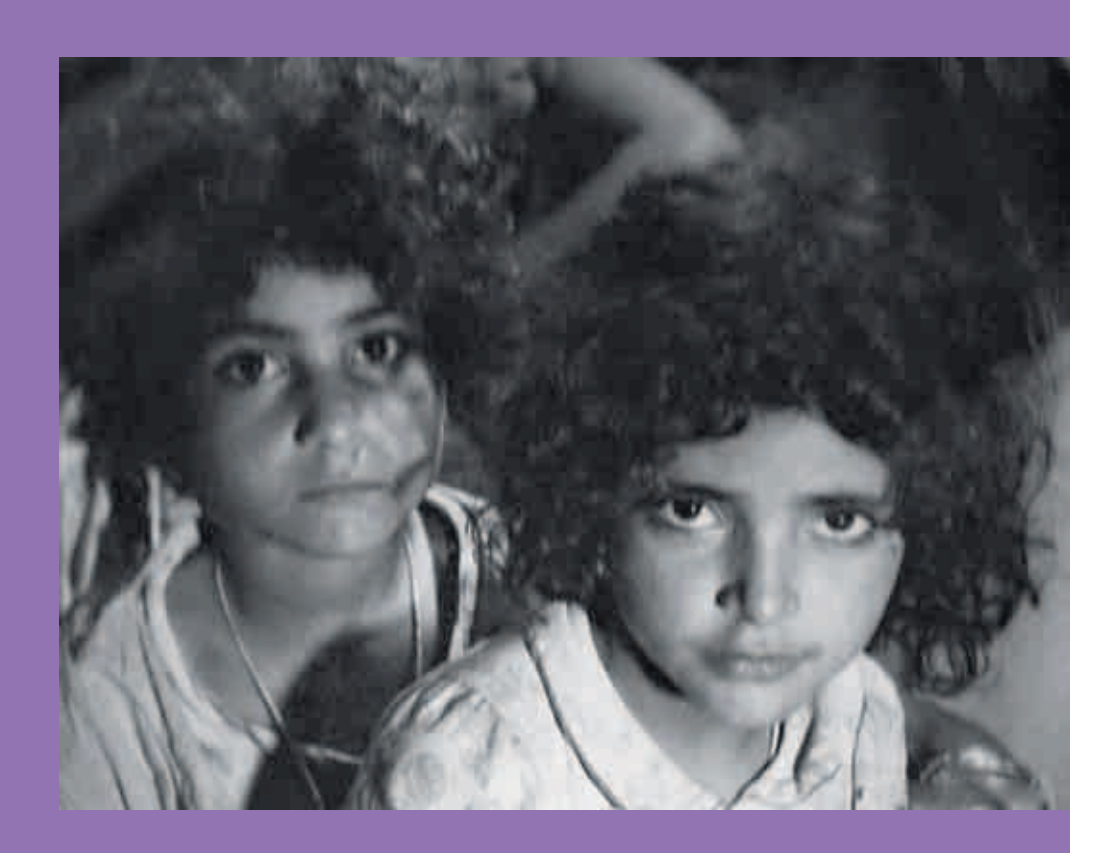
France, fifties. North African young girls taken care of by OSE.